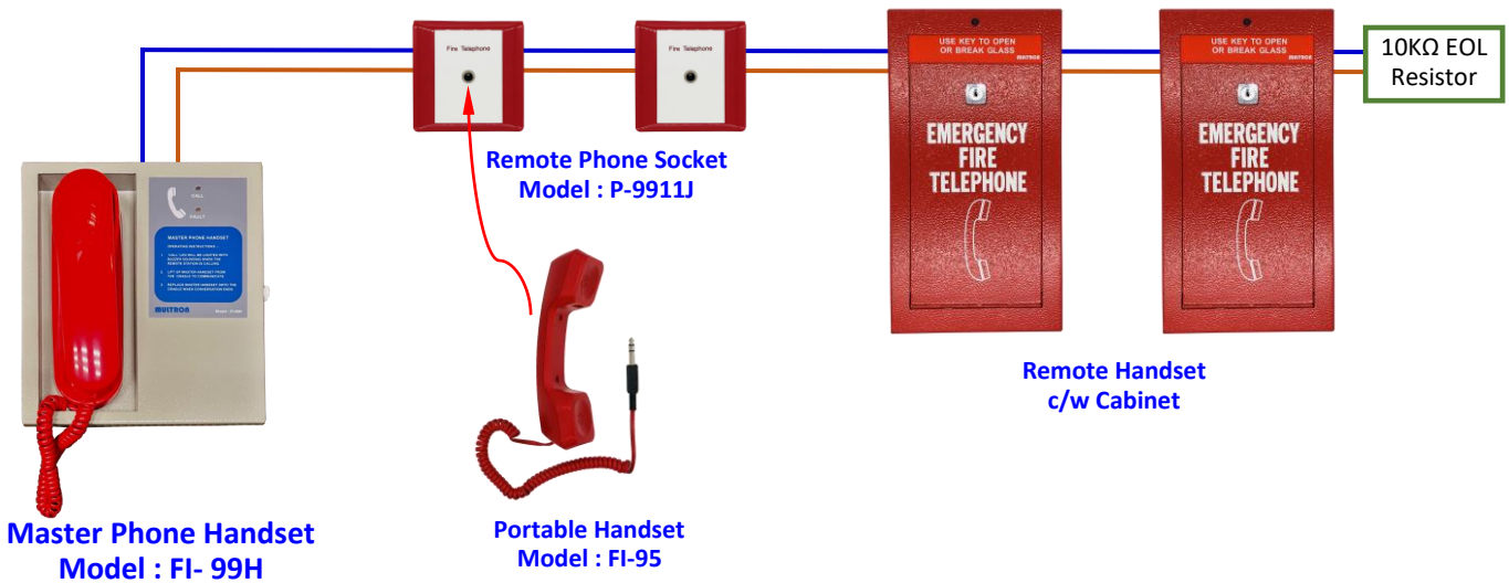
TYPICAL WIRING SCHEMATIC DIAGRAM