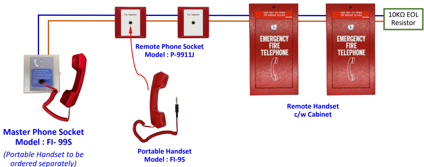
TYPICAL WIRING SCHEMATIC DIAGRAM

Multron Systems Pte Ltd 217 Kallang Bahru, Multron Building Singapore 339 347