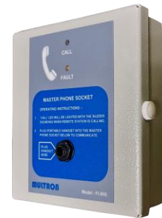
Master Phone Socket Model : FI- 99S