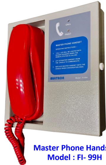
Master Phone Handset Model : FI- 99H