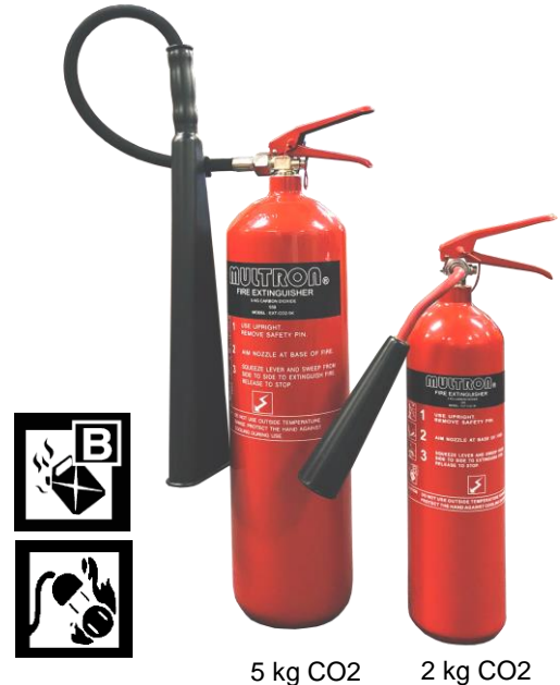
5 kg CO2

Carbon Dioxide (CO2) Extinguishers are suitable for Class B risks involving flammable liquids and for electrical hazards. Harmless to electrical equipment and is ideal for modern offices, electronic risks, and fires caused by the combustion of liquids such as oils, fats, and solvents.