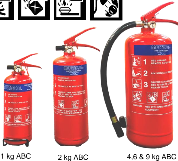
1 kg ABC