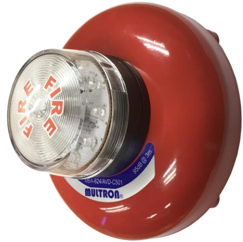
Bell / Strobe Unit Model : MBA624/C501