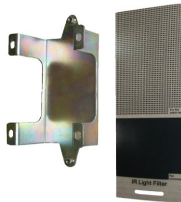
1 pc. Mounting Bracket