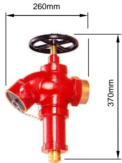
Model : WRV-121